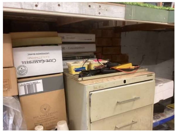
Locos, wagons and coaches are stored under the lower level baseboard