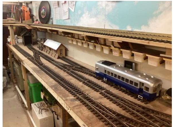
The shunting yard start.