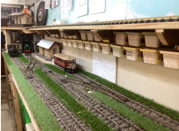
White discs are go – no go “touch” zone at turnout points.