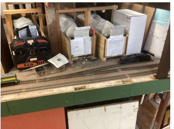
Under the Lower level benchwork there is ample storage for Locos, carriages etc, etc.