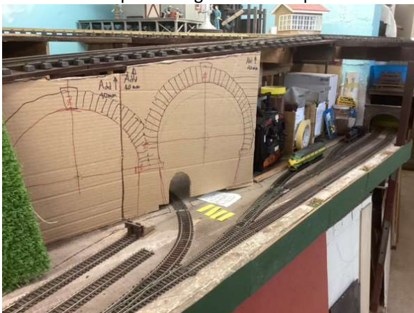
Grandchildren still like to run HO scale trains, so some track is included here for them.