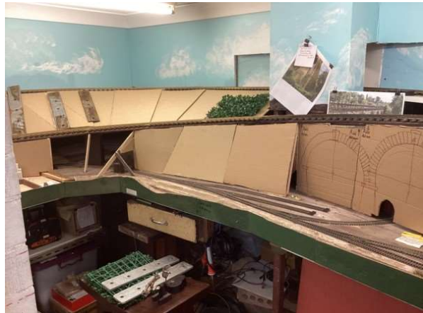
Fake Grass self weight needs a strong support, here 7mm thick double layer cardboard is used.