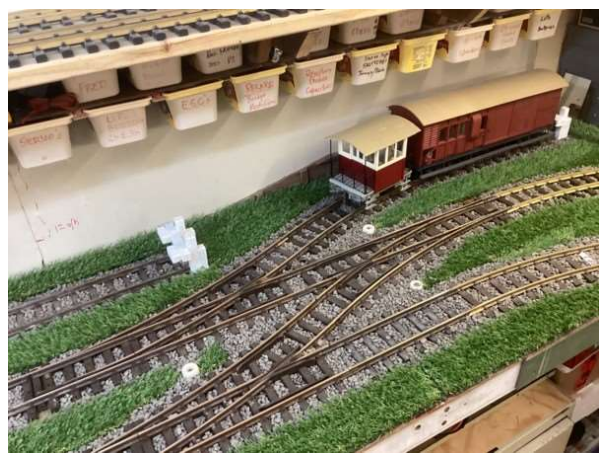
View after ballast and artificial grass laid.