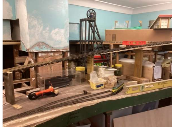
Constructing the 1:12 gradient decline.