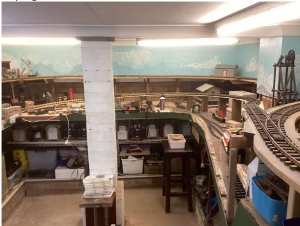
The room is 3.6m x 4.0m.