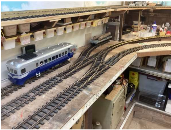
The start of the gradient is the new track upper right.