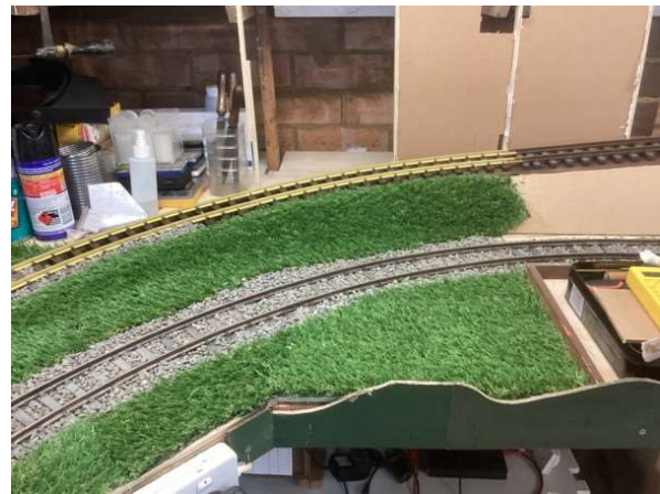
Ballast for track is 5mm Basalt.