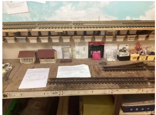
Laying track on the lower level at bottom of decline.