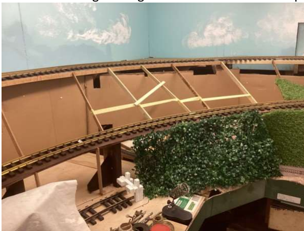
Trial setout for plastic English Box plant sheets.